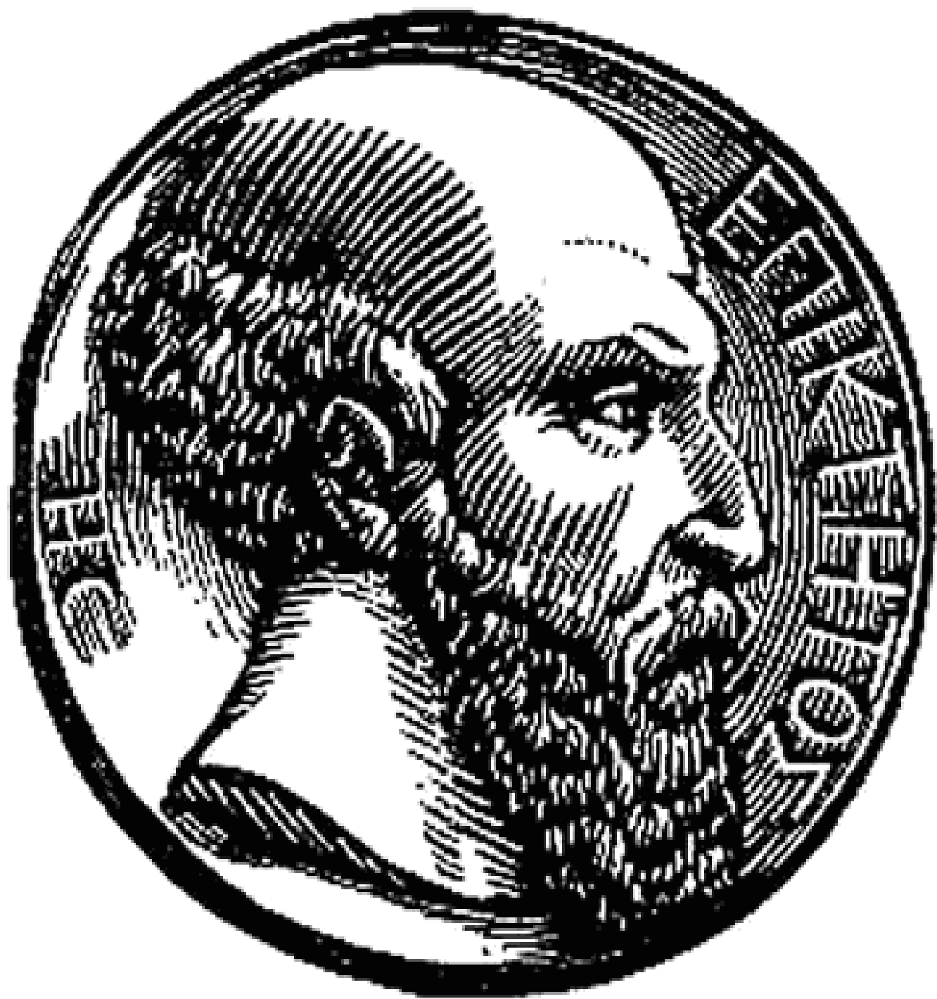
ÉPICTÈTE 55 - 135