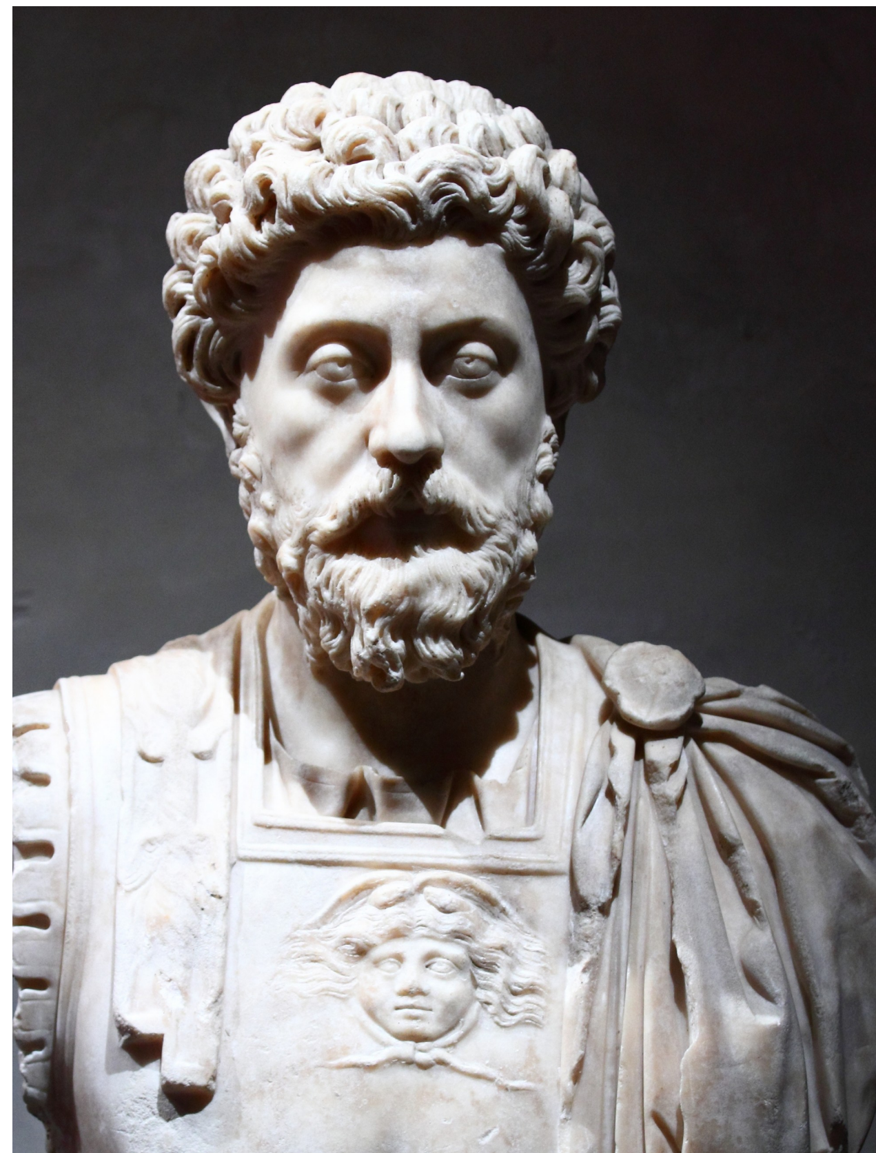
MARC AURÈLE 121 - 180