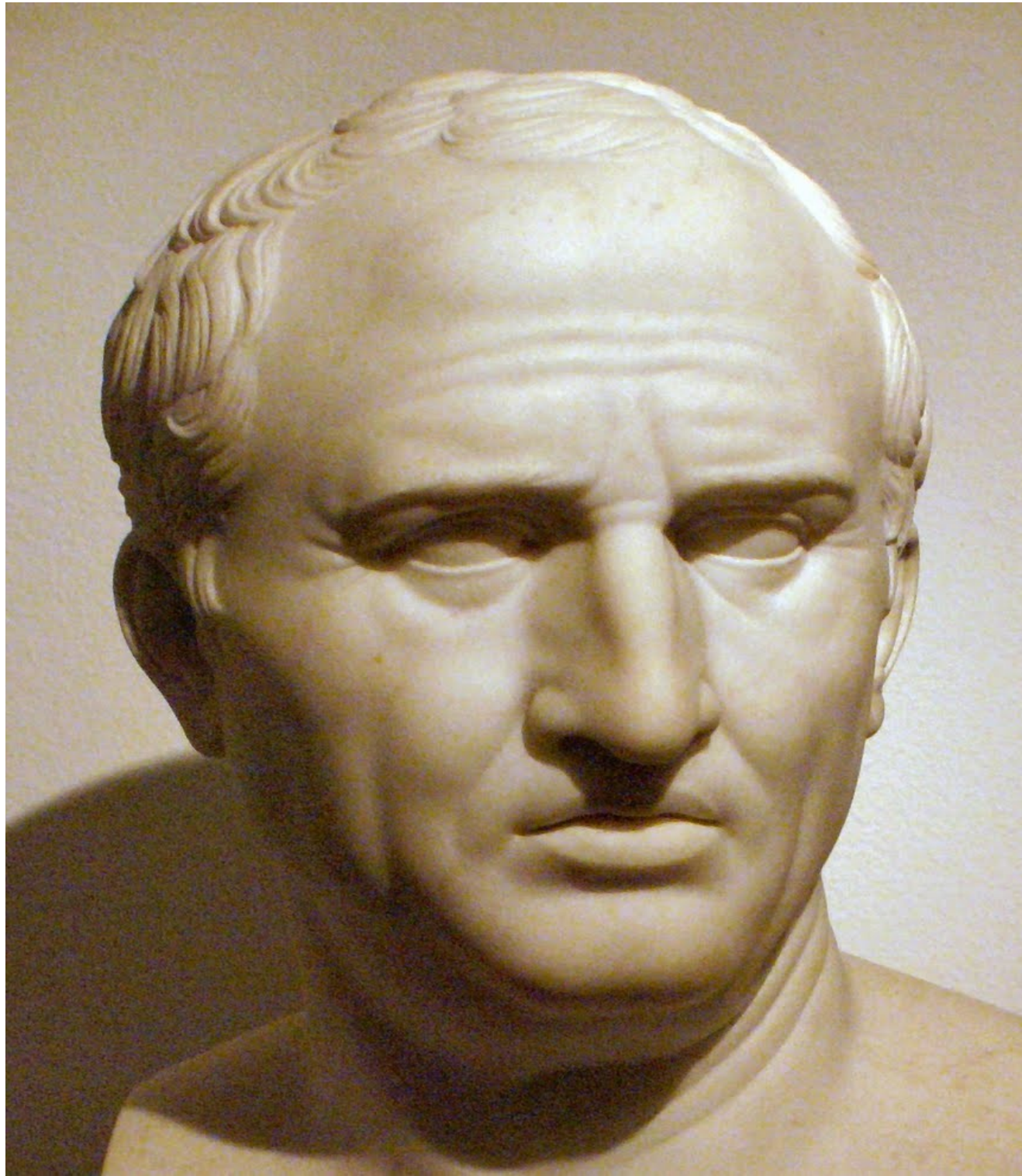
CICÉRON 106 - 43 av. J.-C.